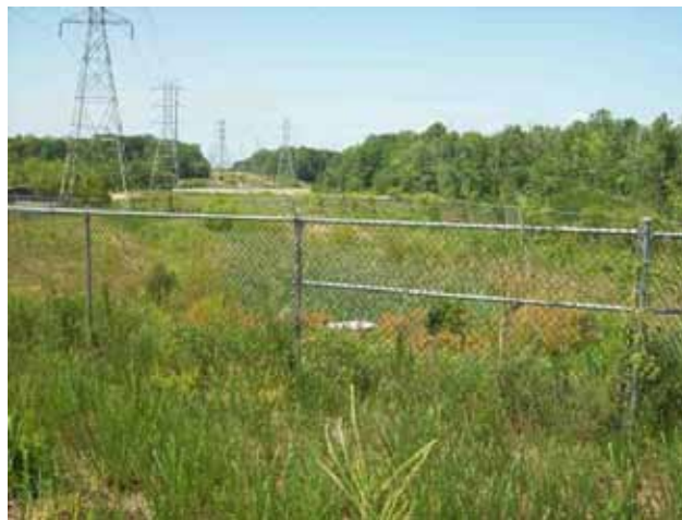
Figure 1. A typical “legacy” BMP. In this case, there was no designated maintenance access.

The past can be ugly: ill-fated love affairs, half-eaten sandwiches under the car seat, leisure suits, and, of course, stormwater BMPs built twenty years ago. The typical diagnosis for one of these “legacy” BMPs: down a steep hill, overgrown, full of sediment and trash, and probably a really ugly chain-link fence (Figure 1).